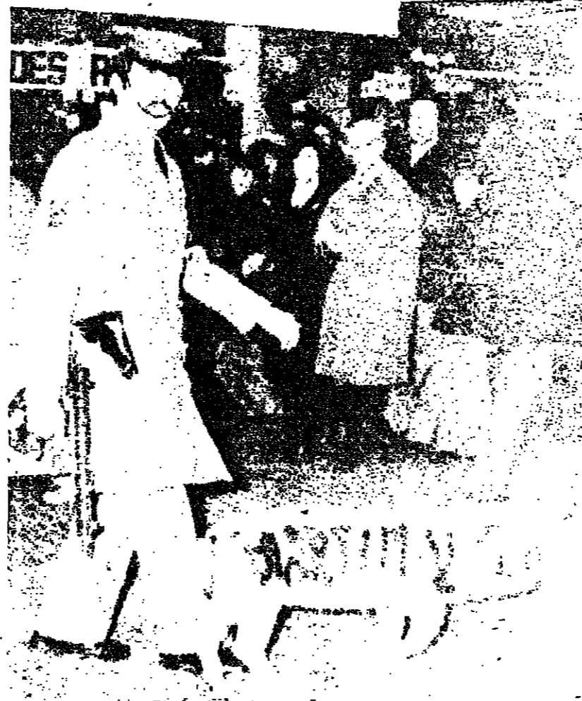
A pig with the name of Martin Villa, Spanish Interior Minister, painted on its side is led by an armed policeman to a police station after ultra-rightists set it free on a busy Madrid street recently.

call in troops to move essential goods held up by a lorry drivers' strike which has crippled supply lines. Trade unions chiefs Wednesday night assured Callaghan they could tame the "flying pickets" who have defied all appeals to allow food and other essentials to leave docks and store depots. After the assurance the Prime Minister was understood to have pulled back from declaring a state of emergency to give unions another chance to call off the pickets. But first reports yesterday said "secondary pickets" were still out in force, blockading firms not directly involved in the pay dispute. Britain's fourth biggest company, the ICI Chemicals giant, said its entire operation was winding down because raw materials were not reaching its plants. A one-day strike by 25,000 train drivers — the second this week — brought all passenger services to a halt. Commuters struggled to work along traffic-clogged, sleet-swept roads but hundreds of thousands stayed away from their jobs.